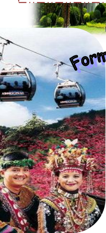
Formosan Aboriginal Culture Village

As the landmark of Hotel Cham Cham, the Cham Tower is the first Continuous Belay System High Rope Course in Taiwan. , Four major adventures and missions are 【Mega Zip】 、 【Free Down】 、 【Sky Walker】 、 【Rock Climbing】 , We invite adventurous young people to take on the once in a lifetime challenge