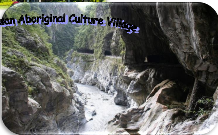
Taroko National Park