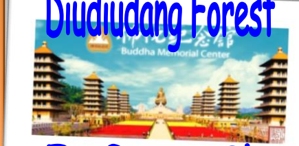
Fo Guang Shan